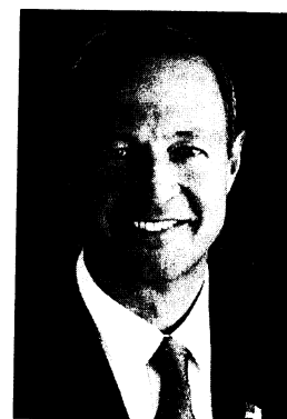
Governor Martin O'Malley