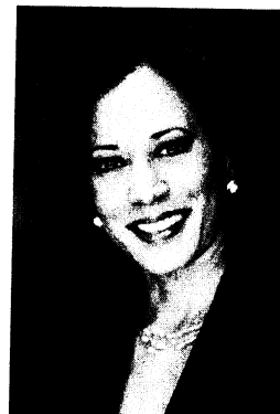
State Attorney General Kamala D. Harris

We have enjoyed being a part of this extraordinary effort, and it is our privilege to present this Report of the Rules Committee for adoption by the 2012 Democratic National Convention.